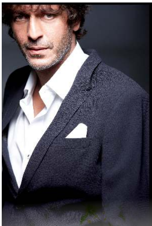
Chunkey Pandey Actor Associate Partner

Tetris Realty Group is a professionalized Transaction Advisory group having partners and partnerships in various Transactions, Developments, Ventures and Aggregations. Tetris Realty Group welcomes and invites groups, individuals, professionals and businesses throughout the globe to be a part of the most developing country in the world “India” for the next 10 years to come. We aim to establish a process oriented and a transparent forum for all and convert this unorganized sector into the most professionalized beneficiary transacting industry. Exposing the niche of this Great Business opportunity, Building the bridges and matching end to end requirements with a clean and healthy view of transacting and doing business in Real Estate, Infrastructure, Hospitality, Health Care and Education counts for our expertise.